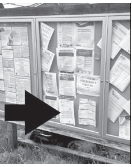
Notice of Sufficiency on project job board