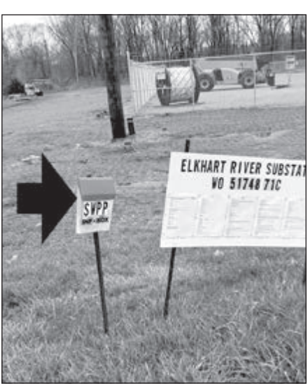
Notice of Sufficiency in document box